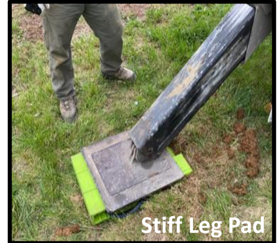
Stiff Leg Pad